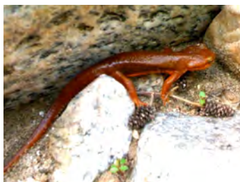
Coast Range Newt in Millard Canyon

Saturday August 28, 2010 2:00-4:00pm Free and open to the public Altadena Community Center 730 E. Altadena Dr.