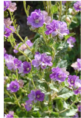
Above: Close-up of the fire follower Phacelia grandiflora on Theo Clarke's property. According to the Catalina Island Conservancy, Phacelia grandiflora had not been seen on the island in over a century until the 1999 fire there.