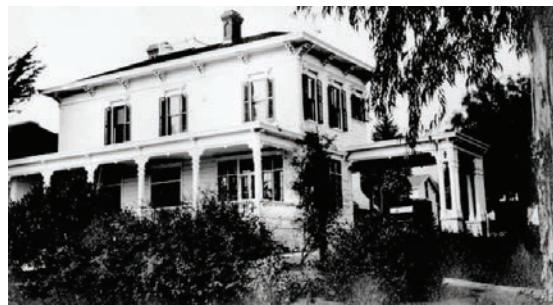
Altadena’s Woodbury house, built in 1883.