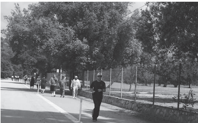
The most popular nearby urban trail circles the Rose Bowl.

We'd like to encourage people to begin thinking about routes that could work. While it can be difficult to imagine something that doesn't exist, it is equally important to realize that many communities have already created just such amenities for themselves. Why not Altadena?