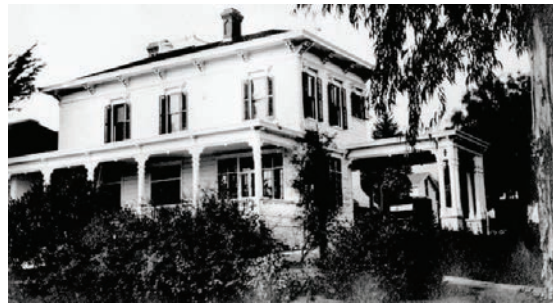
Altadena’s Woodbury house, built in 1883.