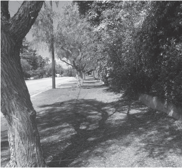
Mariposa Street from El Molino to Marengo Avenue offers an existing urban trail.

If you are interested in forming a committee to look into how to create an urban trail system in Altadena, please contact us at altadenaheritage@earthlink.net .