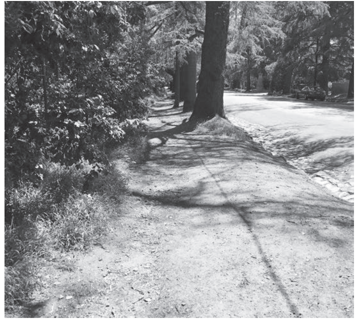
Santa Rosa between Mariposa Street and Altadena Drive has existing footpath separated from the street.