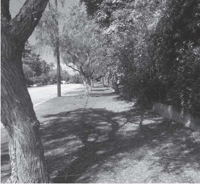
Mariposa Street from El Molino to Marengo Avenue offers an existing urban trail.

If you are interested in forming a committee to look into how to create an urban trail system in Altadena, please contact us at altadenaheritage@earthlink.net .