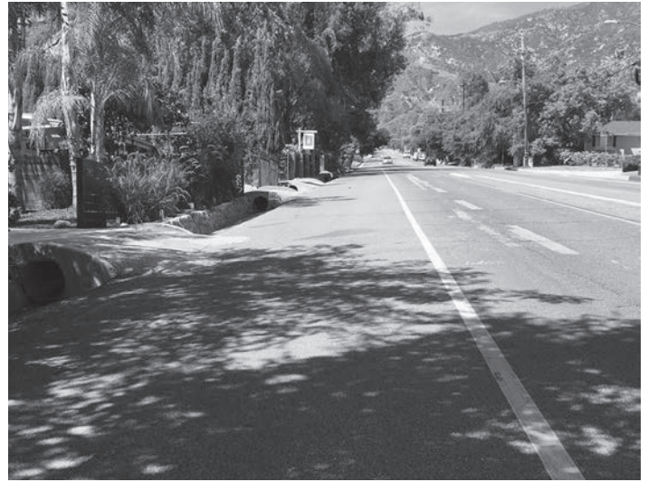
N Lake Ave has room for a trail to Farnsworth Park & Cobb estate.

Unlike the two trail projects that made our "Top 10" priority list (See page 5 story.), one trail project, our number-three vote-getter, failed to make the cut although it has potential to benefit the most Altadenans of all. An urban trail system/in-town exercise loop that connects local parks to regional ones such as Eaton Canyon Nature Center and Hahamongna