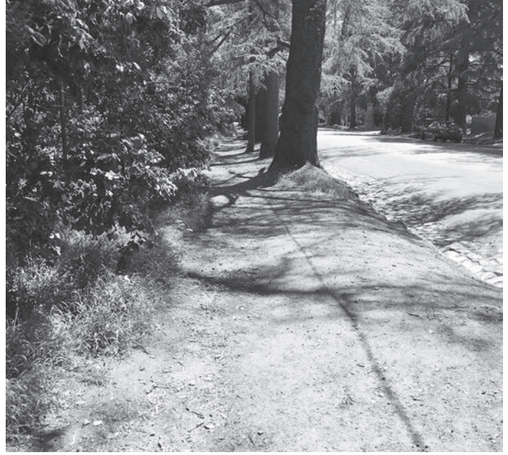
Santa Rosa between Mariposa Street and Altadena Drive has existing footpath separated from the street.